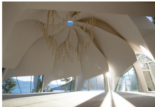
Temple of Light

On day three, the tour will start with a short ferry ride to Kootenay Bay to visit Yasodhara Ashram, a yoga retreat founded in 1963 and the home of the award winning Temple of Light designed by Patkau Architecture. The visit will be guided by representatives from Spearhead Timberworks, the company responsible for manufacturing this architectural marvel.